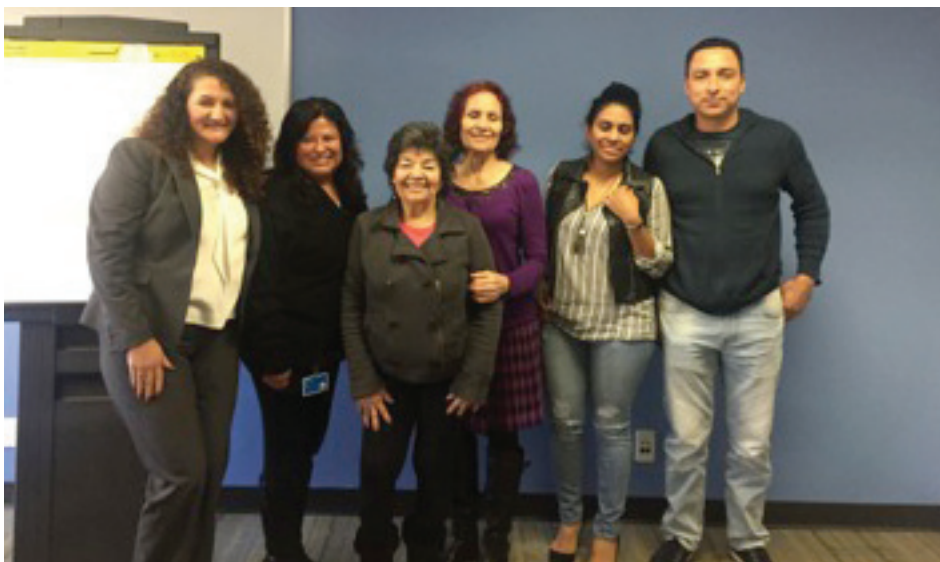
January 2017 RFA PreService (Spanish)

We're proud to announce the formation of San Francisco Families Making a Difference Mentor Program