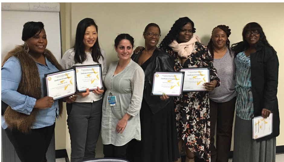
Recent graduates from SA/HIV Cycle 2