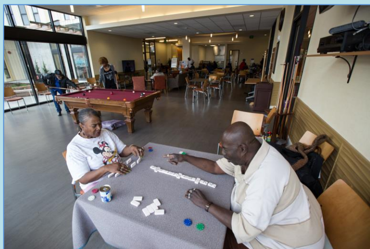
Recreation and social engagement at the Dr. George W. Davis Senior Center