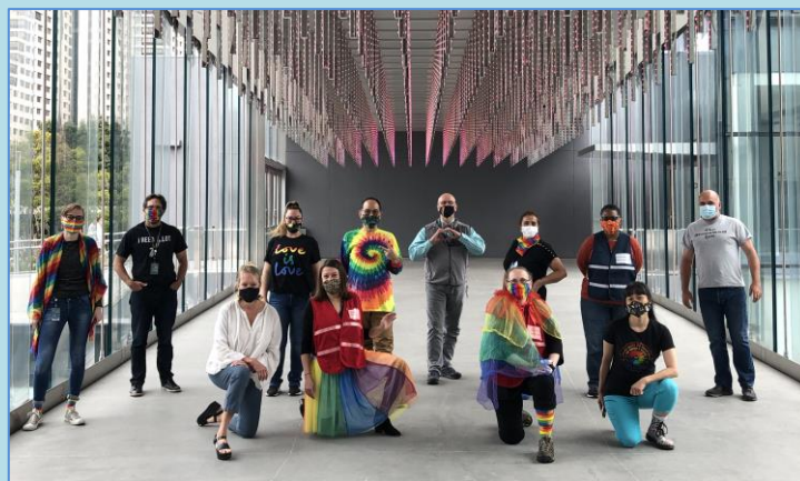
Staff deployed with the SF Human Services Agency COVID-19 response celebrate Pride Month