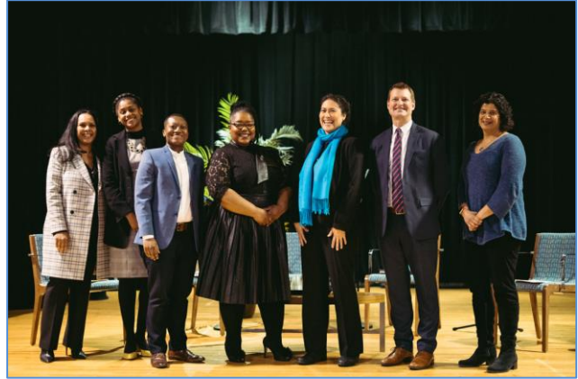
SFHSA Town Hall on Racial Equity in February 2020

This year, APS began implementing the Trauma-Informed Systems (TIS) framework, a public health model for organizational change and trauma-informed practice that enables us to respond more effectively to each other and the people we serve. The implementation process is being guided by the program's staff-led Healing Organization Workgroup, which began convening monthly in late 2019. The workgroup administered a baseline survey to APS staff in February to identify the program's strengths and areas for growth. Since then, the workgroup has been processing the survey results and determining priority areas in which to focus the program's TIS efforts – particularly in light of operational challenges posed by the outbreak of COVID-19, and the ways in which the pandemic may exacerbate existing traumas and generate new ones among our clients and workforce, alike.