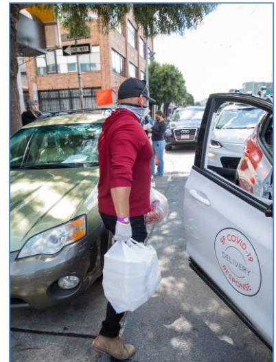
Great Plates Delivered SF

The coronavirus pandemic has exacerbated existing food insecurity, and we have helped our partners bolster existing programs and develop new resources to safely and effectively meet growing food needs in this new environment. With new freezers and funds to purchase other needed supplies, our Congregate Meal providers rapidly modified operations to provide meals to-go; they distributed an extra 275,000 meals between April and June. Home-delivered food resources grew significantly through our Home-Delivered Meal program and partnership with the SF-Marin Food Bank that brings groceries directly to at-risk older adults sheltering in place. We launched Great Plates Delivered SF, a temporary program model developed by the state; utilizing restaurants to prepare and deliver meals, the program provides relief to both at-risk older adults and local businesses. This added 147,000 meals in our community in May and June. Our food programs have been a lynchpin in the City's strategies to support older people and adults with disabilities to shelter in place.