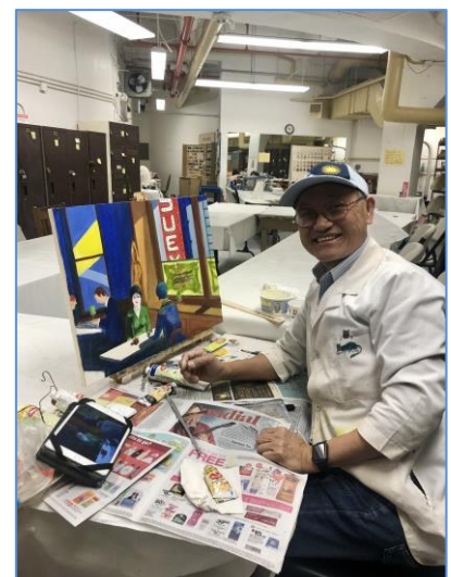
Art classes at the Aquatic Park Senior Center

Collectively, DAS staff and community partners conducted approximately 30,000 wellness calls as part of the emergency response to the COVID-19 outbreak. Prioritizing current clients at highest risk – such as those 80 years or older, living alone, and/or with significant personal care needs – staff made calls to ensure people were aware of public health directives such as Shelter in Place, their essential needs including were being met, and they knew the DAS Benefits and Resource Hub was available to provide information and other support if needed. The DAS Hub reached out to over 190 individuals in need of additional follow-up, but who lacked the capacity to call the helpline themselves. Data collected from these calls helped to identify trends in unmet needs, and has helped to inform planning for supportive aging and disability services during the pandemic response.