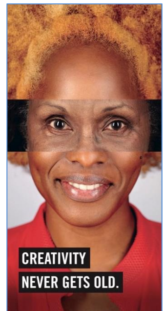
Reframing Aging SF campaign material

Ageism and isolation are all too common hallmarks of our communities. Many older adults experience feelings of being undervalued and invisible. This year, we harnessed two years of collaborative research, discussion, and planning to launch the Reframing Aging San Francisco campaign. Over Fall 2019, we ran a public messaging campaign that integrated traditional and social media strategies, putting forth vivid imagery that engaged viewers in thinking about characteristics, like creativity and courage, that never get old. The campaign stars were local seniors whose stories were shared alongside information about ways to get involved in the campaign and connect with older community members. This effort was co-led by the Community Living Campaign, Metta Fund, and DAS and developed with input from an advisory group of service providers. The campaign has been recognized both in the advertising and social service sectors, most recently winning an Aging Innovation Award from the National Association of Area Agencies on Aging.